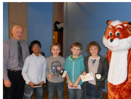
Under 11 Winners